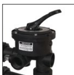
6-position valve with integrated pressure gauge