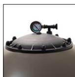
Wide top opening for easier sand loading