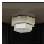
Drain plug for easy maintenance